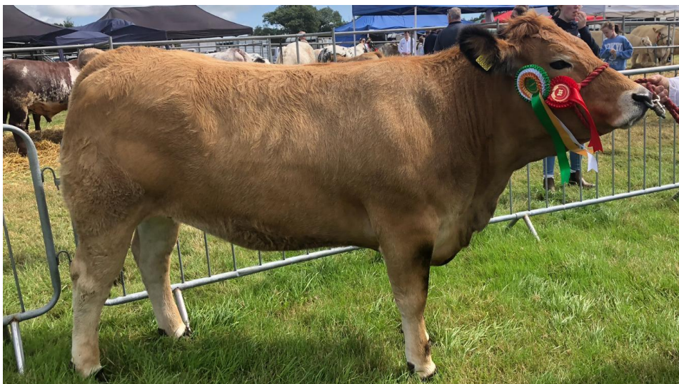
Left: Altamont Sunset (1 st Place in the in-calf heifer class and overall show champion)