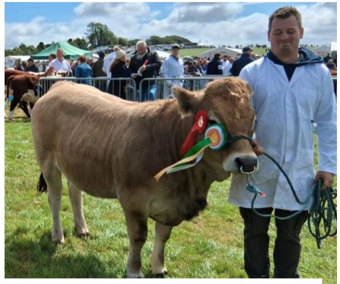
Above: Kayreerk Ursa (1 st Place in the maiden heifer class and reserve show champion )